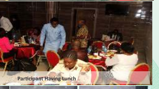
Participant Having Lunch