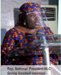
Rep. National President-NLC Giving Goodwill message