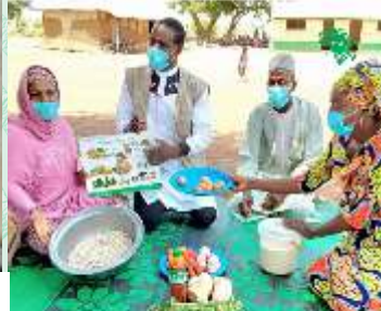
The shade of nutrition as local pregnant women and children under-5 receive growth and development of national lives and they are encouraged to take a picture of the poster and bring it to the nearest AYGF health center for a health check-up. The children who are charged with relaying such messages are to be commended.