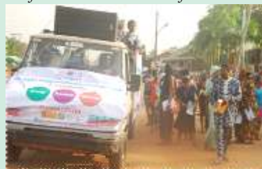
Street Campaign on ECOWAS SEE Project