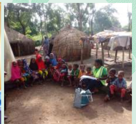
Community Volunteer offering service to beneficiaries