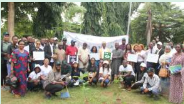
Group photograph of Stakeholders, AYGF Team and Printrite Global Services.