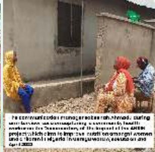
A community leader managing a health shed, starting an exercise on sensitizing a community health worker to facilitate awareness of the importance of the impact of the ANRIN project which aims to improve health on amongst women and children in Nigeria in Ikeja Lagos, on the 20th of April 2022.