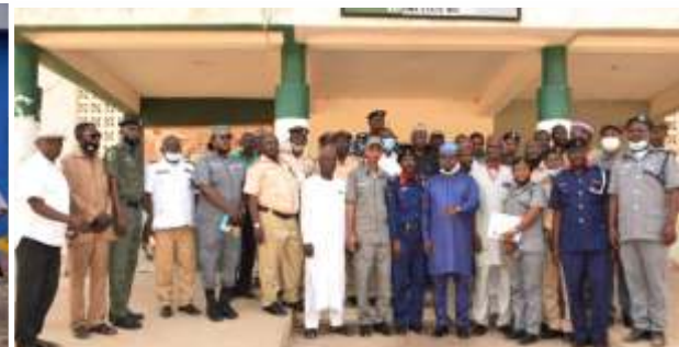
Group picture at the Nigerian Customs Service station - Jibiya Border Katsina State.