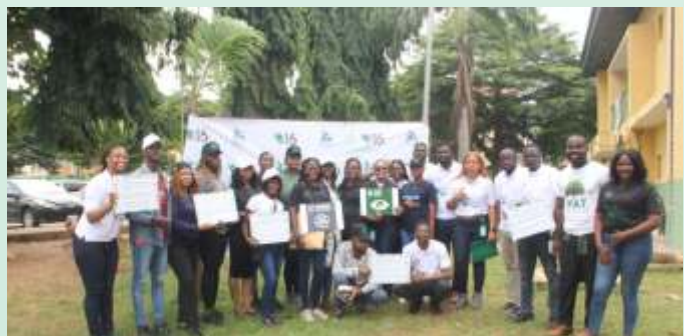
Group photograph of AYGF and Printrite Global Services at the tree planting Ceremony