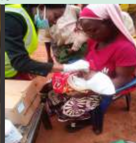
AYGF ANRiN Community Health Worker offering service to beneficiary