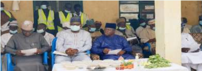
Members of the high table

The Accelerating Nutrition results in Nigeria (ANRiN) IS a World Bank funded project being implemented by AYGF to address issues of Malnutrition in Nigeria. The overall objective of the project is to increase the utilization of quality cost effective nutrition services for pregnant and lactating women, adolescent girls, and children under the AGES of 5. The project is currently being implemented in 13 LGAS in Niger State (8 LGAS in Niger South and 7 LGAS from Niger East) and 10 LGAS in Kogi (9 LGAS from Kogi East and 1 LGA for Kogi Central).