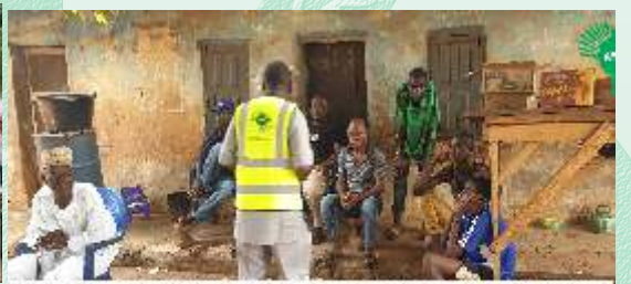
MEN PARTICIPATING IN A KNOWLEDGE SHARING EXERCISE FACILITATED BY AYGF IN KOGI ENCOURAGING THEIR WIVES AND MOTHERS TO PARTICIPATE IN PATRONIZING NUTRITIONAL SERVICES ON THE 31ST OF MARCH, 2022.