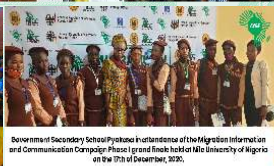
Government of Secondary School Pyakasa in attendance of the Migration Information and Communication Campaign Phase I grand finale held at Nile University of Nigeria on the 17th of December, 2020.