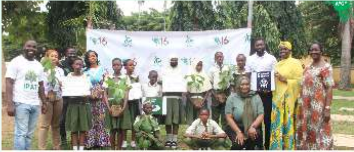
AYGF Staff, the Principal of JSS Garki and students join to take a photo on the 28th of July, 2022 at JSS Garki Area II, Abuja.