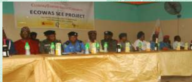
Stakeholders at the closing ceremony of the ECOWAS SEE Project