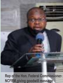
Rep of the Hon. Federal Commissioner-NCFRM giving goodwill message