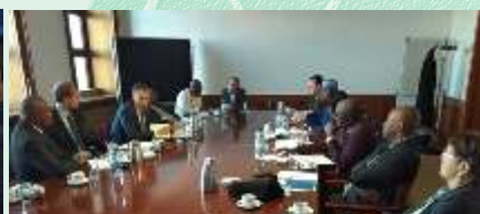
Delegation discussion with Officials of the German Foreign Affairs Ministry at their headquarters in Berlin