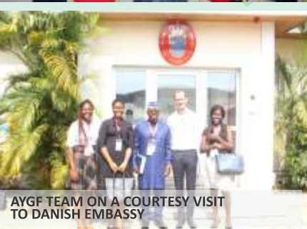
AYGF TEAM ON A COURTESY VISIT TO DANISH EMBASSY