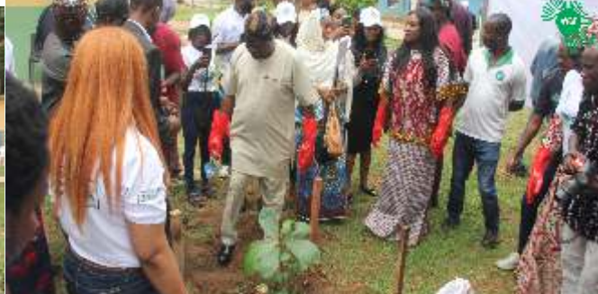
AYGF staff and stakeholders participating in a tree planting exercise at JSS Garki, Area II, Abuja on the 28th of July, 2022.