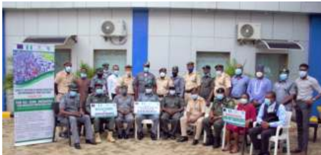
Group photograph from the training of Border Operatives at Mfum Border, Cross River State.