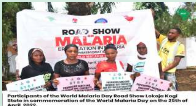
Participants of the World Malaria Day Road Show Lokoja Kogi State in commemoration of the World Malaria Day on the 25th of April, 2022.