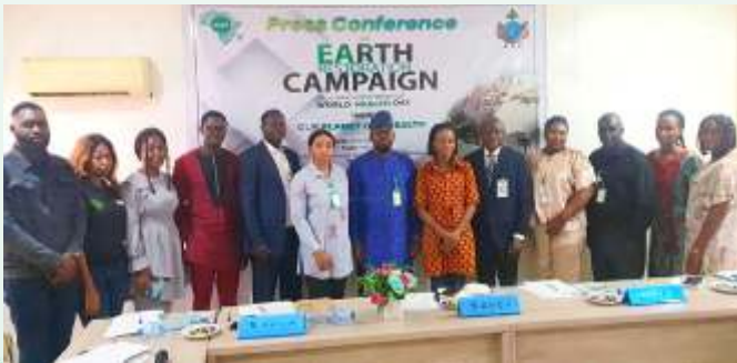
AYGF Team with OXFAM and NOSDRA at the press conference

AYGF on the 29 th of April, 2022 launched the 'Earth Restoration Campaign', to increase awareness and understanding of the consequences of climate change through strategic partnership with relevant stakeholders and mass mobilisation across the Country. Through this project, AYGF seeks to strengthen partnerships to address Environment & Climate Change issues within and outside Nigeria to increase awareness of the harmful practices that results in climate change while providing technical support for the implementation of the operational framework for the climate change initiatives. Kindly see pictures from the press conference below;