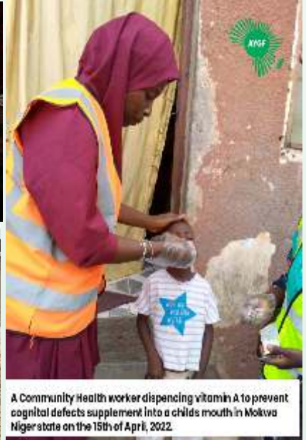
A Community Health worker dispensing vitamin A to prevent cognitive defects supplement into a child's mouth in Mokwa Niger state on the 15th of April, 2022.