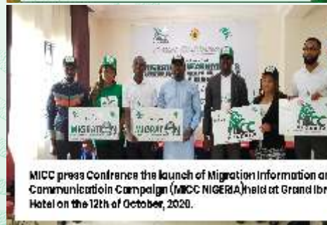
MICC press Conference the launch of Migration Information and Communication Campaign (MICC NIGERIA) held at Grand Ibra Hotel on the 12th of October, 2020.