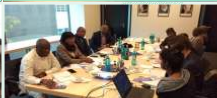
Delegation meeting with International Organisation for Migration (IOM) Germany Team in Berlin