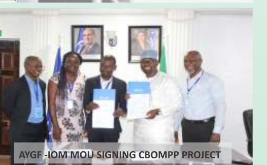
AYGF -IOM MOU SIGNING CBOMPP PROJECT