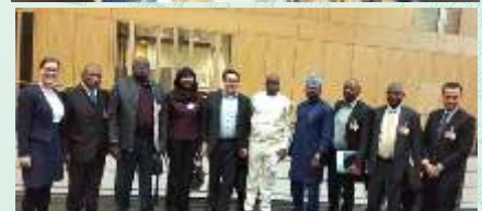
Delegation meeting with Mr Stefan Rouenhoff, Member of Parliament, CDU and Head of Project Group, Africa, German Parliament (Deutscher Bundestag).