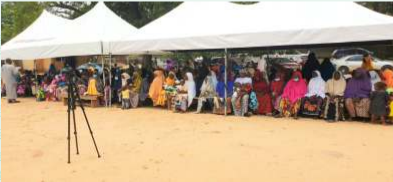
Cross section of community members at the flag off ceremony, Lapai Niger State