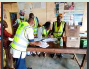
AYGF ANRiN Community Desk Officers offering service to beneficiary