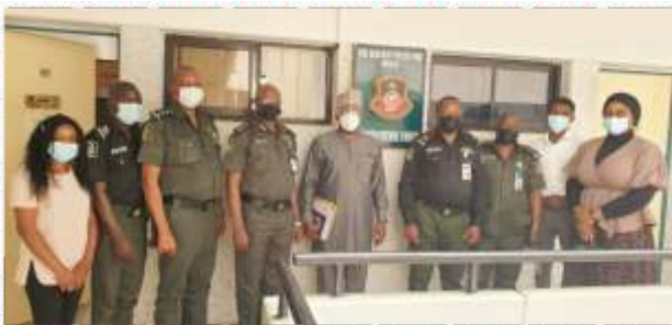
AYGF on Advocacy Visit to the Nigerian Police Force (NPF)