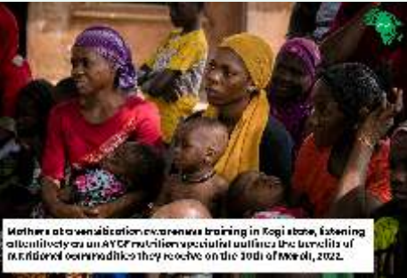
Mothers at a sensitization exercise training in Kogi state, listening attentively as an AYGF nutrition specialist outlines the benefits of nutritional commodities they receive on the 20th of March, 2022.