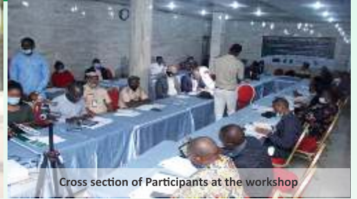
Cross section of Participants at the workshop