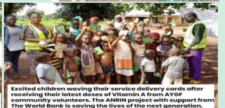
Excited children waving their service delivery cards after receiving their latest doses of Vitamin A from AYGF community volunteers. The ANRIN project with support from The World Bank is saving the lives of the next generation.