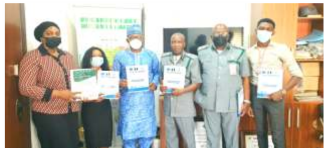
AYGF on Advocacy Visit to the Nigerian Customs Service (NCS)