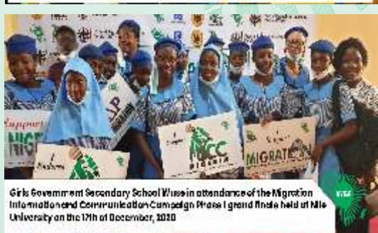
Girls Government Secondary School Wusein attendance of the Migration Information and Communication Campaign Phase I grand finale held at Nile University on the 17th of December, 2020