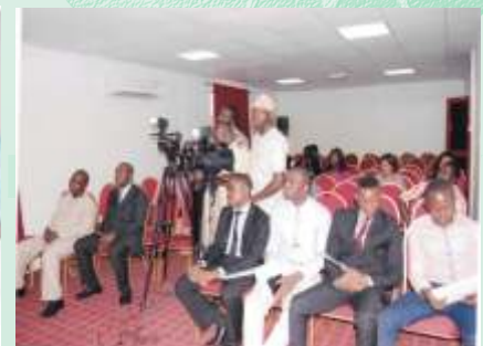
Cross section of participants at the event