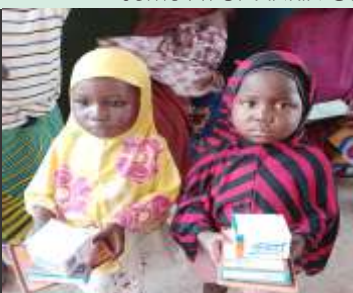
Some AYGF ANRiN Beneficiaries under the age of 5, posing with their nutritional supplements