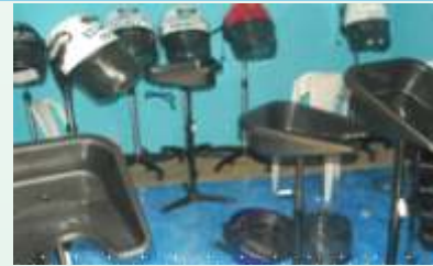
Hair dressing Salon equipment for project beneficiaries