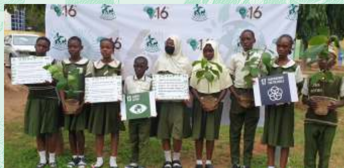
Group photograph of some students of the Junior Secondary School Area 11 Garki Abuja.