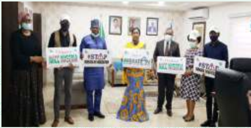
Advocacy visit to National Agency for the Prohibition of Trafficking in Persons we were received by the DG NAPtIP, Dame Julia Okah-Donli (28 th Oct 2020)

The project succeeded in mainstreaming issues on irregular migration within 10-35 year old demography who are most vulnerable to irregular migration and trafficking and all the dangers associated with it. Through this project a total number of 5,825,000.00 million Nigerians were sensitized on the dangers of irregular migration and regular pathways.