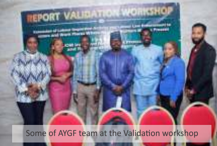
Some of AYGf team at the Validation workshop