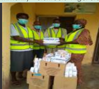
AYGF ANRiN KOGI Community Health Workers ready for service delivery