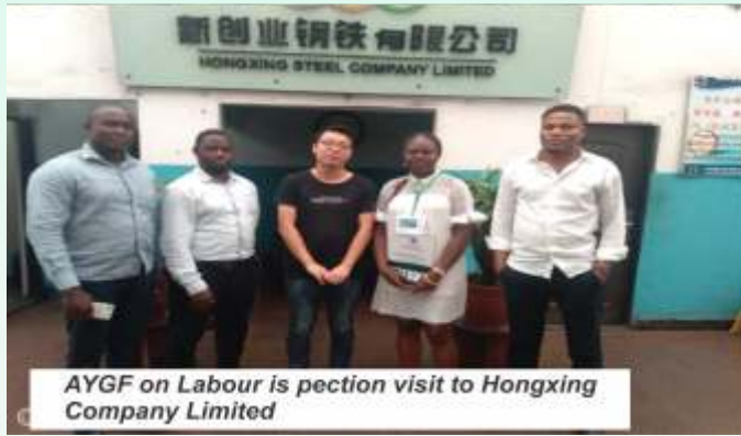
AYGF on Labour inspection visit to Hongxing Company Limited