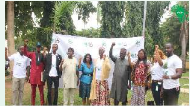
AYGF staff alongside representatives of MINASA, Ministry of Health, Primary and Secondary Education, Ministry of Education, Science and Technology, and Ministry of Environment, Conservation and Forestry participating in a tree planting exercise at JSS Garki, Area II, Abuja on the 28th of July, 2022.