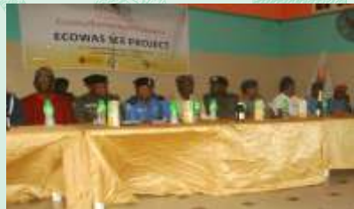
Stakeholders at the closing ceremony of the ECOWAS SEE Project