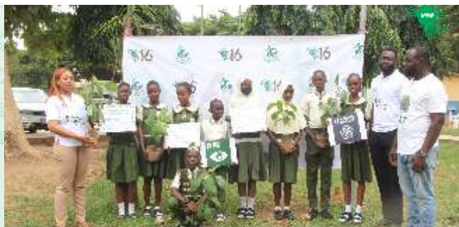
AYGF staff and JSS Garki students holding a banner to be planted in the school grounds on 28th of July, 2022.