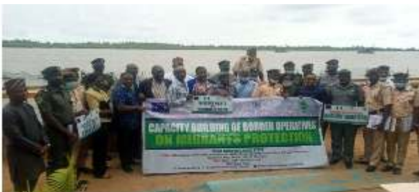
AYGF on Advocacy Visit to the National Human Rights Commission-NHRC