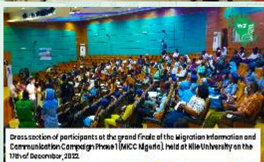
Cross section of participants at the grand Finale of the Migration Information and Communication Campaign Phase I (MICC Nigera), held at Nile University on the 17th of December, 2020.