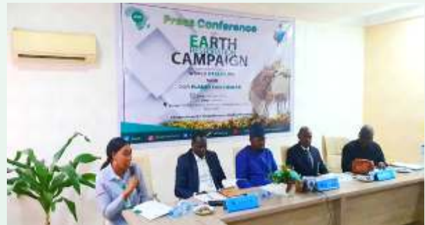
AYGF Team with OXFAM and NOSDRA at the press conference