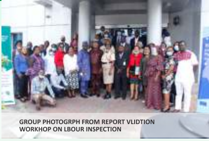
GROUP PHOTOGRAPH FROM REPORT VALIDATION WORKSHOP ON LABOUR INSPECTION