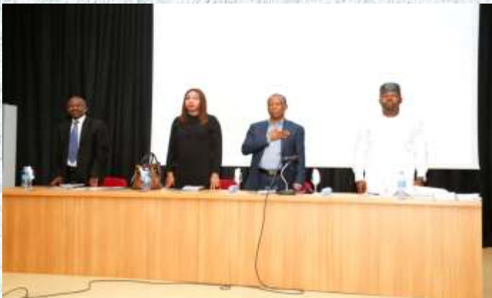
Cross section of mentors at the event

AYGF in partnership with Nile University organized the Youth Leadership and Mentoring Programme in the year 2019, the project was aimed at creating an avenue for mentors to pitch their leadership/ business ideas in providing guidance and direction to the youth and young leaders who may venture into the leadership space in the future. The programme was a success, it was well attended by Young Politicians, Young Professionals, Students, Young Entrepreneurs, Public figures, personalities. There was interactive session, questions and answer session between the mentors, mentees and other participants at the event.