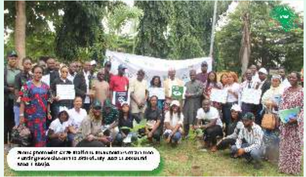
AYGF staff and stakeholders participating in a tree planting exercise at JSS Garki, Area II, Abuja.