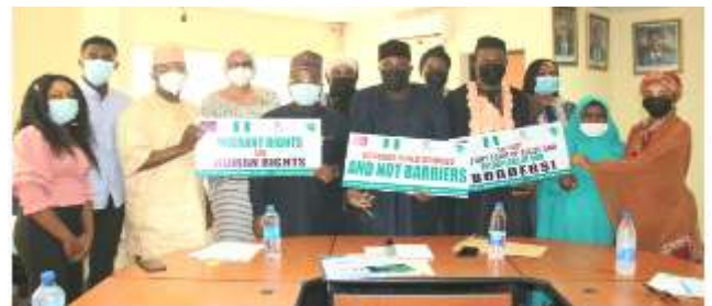
Group photograph from the training of Border Operatives at Seme Border, Lagos State