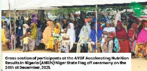
Cross section of participants at the AYGF Accelerating Nutrition Results in Nigeria (ANRIN) Niger State Flag off ceremony on the 24th of December, 2021.