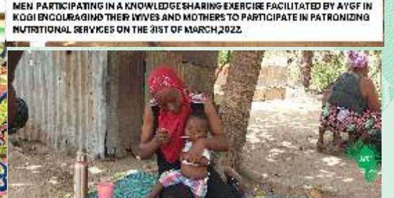
A mother feeding her baby Micro Nutrient powder mixture with pap in Geregu Ward Ajeokute Kogi State under the ANRIN Project on the 2nd of April, 2022.