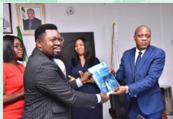
Executive Director AYGF and Statistician General NBS exchanging M.O.U.