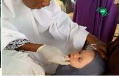
A Community Health worker dispensing vitamin A supplement into a child's mouth in Mokwa Niger state on the 14th of April, 2022.