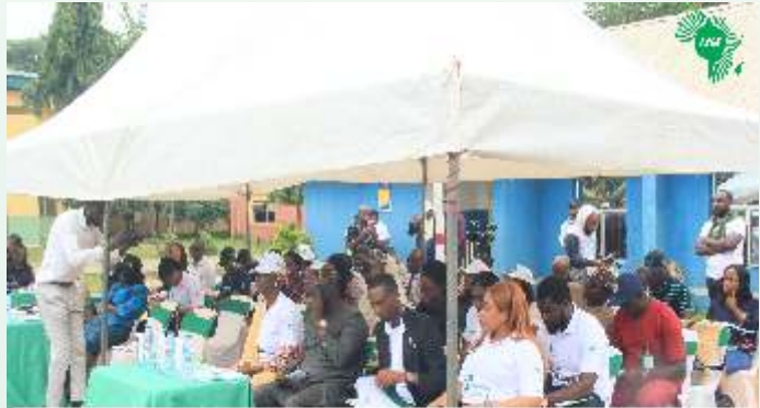
AYGF staff and stakeholders during the Tree Planting exercise of JSS Garki, Area II, Abuja on the 28th of July, 2022.