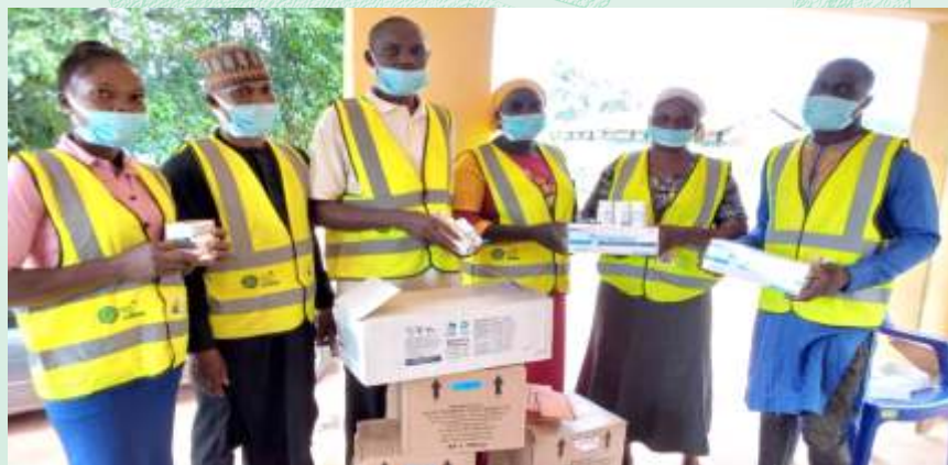
Some AYGF ANRiN Community Volunteers -Niger State