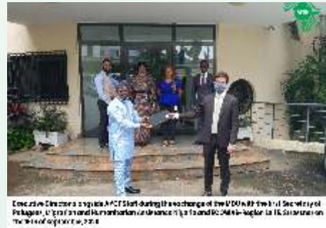
Executive Director engage AYGF Staff during the change of the MD with the Secretary of Police, Labour and Humanitarian assistance (LPH) and IC-ME-Inspector in IS Collaboration on the 16th of September, 2020.