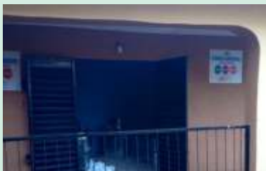
Training Centre established at Idiroko border community