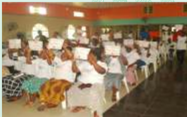
Participants at the closing ceremony