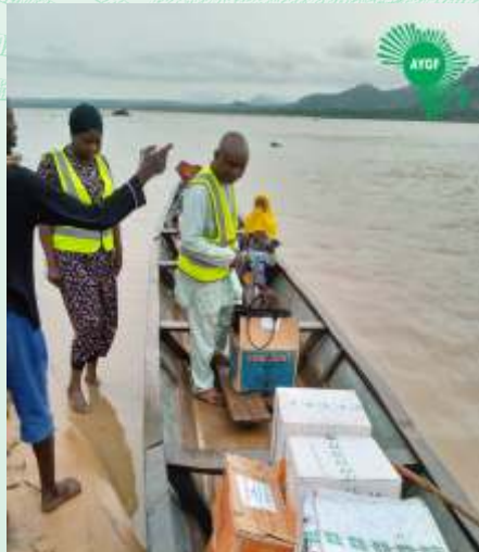
With a pledge to leave no one behind, AYGF community health workers go over and beyond to ensure that nutritional services are rendered to mothers and children in Kogi State under the Acceleration Nutrition Result in Nigeria Project (ANRIN).