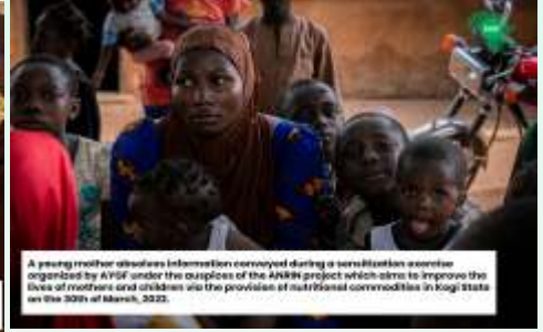
A young mother shares information conveyed during a sensitization exercise organized by AYGF under the auspices of the ANRIN project which aims to improve the lives of mothers and children via the provision of nutritional commodities in Kogi State on the 20th of March, 2022.