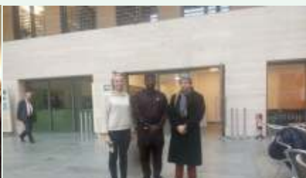
AYGF's E.D. Meeting with the Officials of the Ministry of Foreign Affairs, Federal Republic of Germany at their headquarters in Berlin.