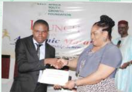
Presentation of Scholarship Award to a winner