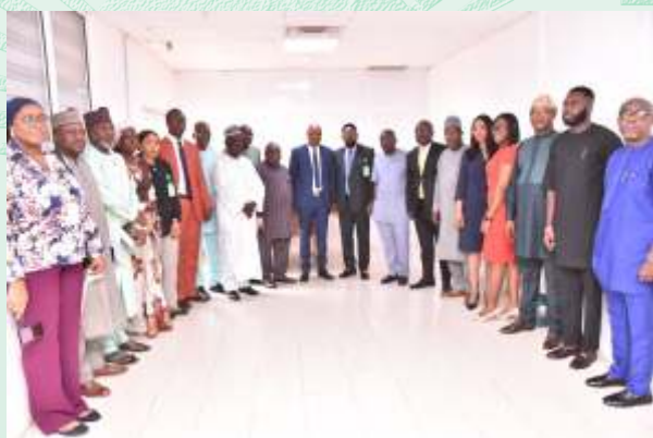
Group photograph at the AYGF COVAPS M.O.U Signing with NBS