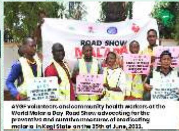
AYGF volunteers and community health workers of the World Malaria Day Road Show advocating for the prevention and curative treatment of and testing malaria in Kogi State on the 25th of June, 2022.