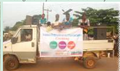
Beneficiaries showing off their certificates training during the closing ceremony of the ECOWAS SEE Project