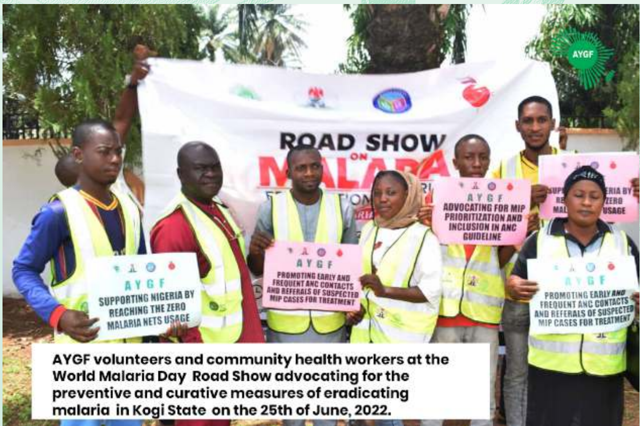
AYGF volunteers and community health workers at the World Malaria Day Road Show advocating for the preventive and curative measures of eradicating malaria in Kogi State on the 25th of June, 2022.