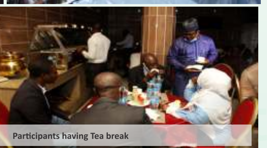
Participants having Tea break