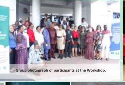
Group photograph of participants at the Workshop.