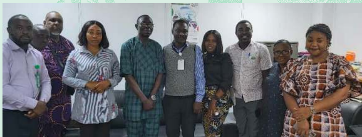
Group photograph- Technical Committee on COVAPS (AYGF, NBS Team)