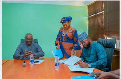
Pictures taken with Staff of both organizations.