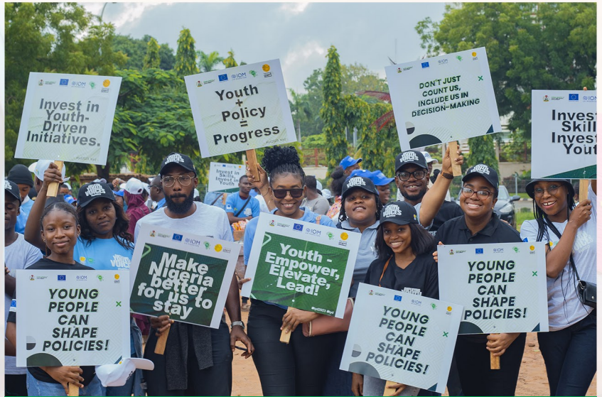
AYGF Staff at the International Youth Day Roadshow 2023.

A central aspect of our commemoration was the International Youth Day Roadshow under the theme "Green Skills for Youth." This dynamic event sought to equip young individuals with essential skills for a sustainable future while fostering environmental awareness and responsibility.