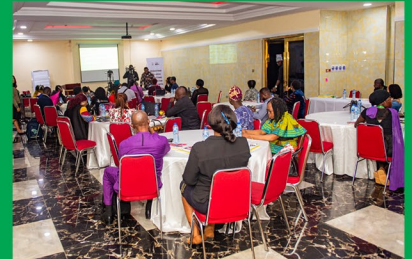
More Photos from the meeting.

The panel discussion featured experts from organizations like the National Council for Persons with Disabilities, Shehu Musa Yaradua Foundation, CBM, and The Albino Foundation. This thought-provoking conversation delved into challenges arising from limited data availability for policy implementation in inclusive education.