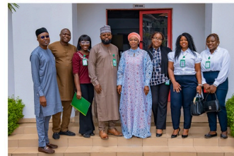
AYGF COMMUNICATIONS TEAM PAYS A COURTESY VISIT TO LEADERSHIP NEWSPAPER

No. 4 Ouagadougou, Street, Wuse Zone 2, Abuja