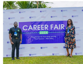
NILE UNIVERSITY CAREER FAIR