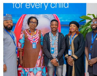
AYGF TEAM PAYS COURTESY VISIT TO UNICEF