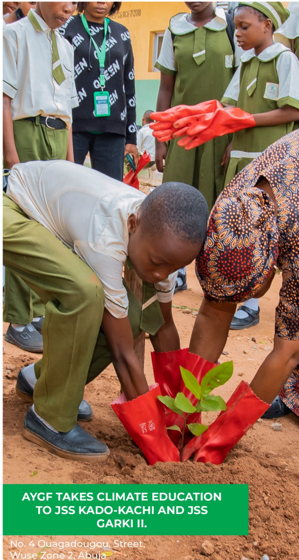
AYGF TAKES CLIMATE EDUCATION TO JSS KADO-KACHI AND JSS GARKI II.

No. 4 Ouagadougou, Street, Wuse Zone 2, Abuja